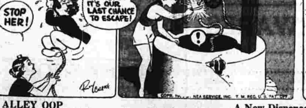
ALLEY OOP OOOLA TROOP AN AWFULL LOT OF PEOPLE WANTING IN TH THIRN ROOM!