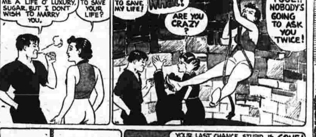
WASHINGTON TUBBS THANKS FOR OFFERING ME A LIFE OF LUXURY AND SUGAR, BUT I DON'T WISH TO MARRY YOU!